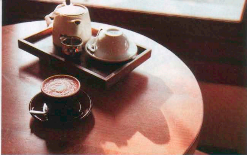
FOREST FOR THE TREES Opposite, the Armstrong Redwoods State Reserve; above and right, Flying Goat Coffee