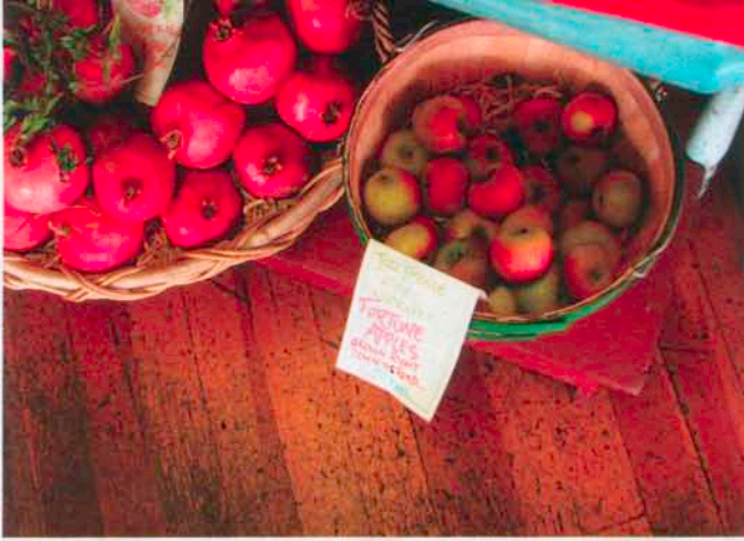
BOUNTY HUNTING Opposite, the unmistakable Hop Kiln Winery, and above, pomegranates and apples at the Jimtown Store